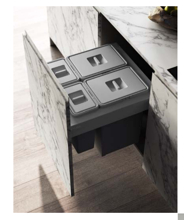
Above: pull out base cabinet for trash bin.

Detail of the steel wire internal accessory.